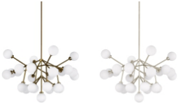
frost / aged brass frost / satin nickel